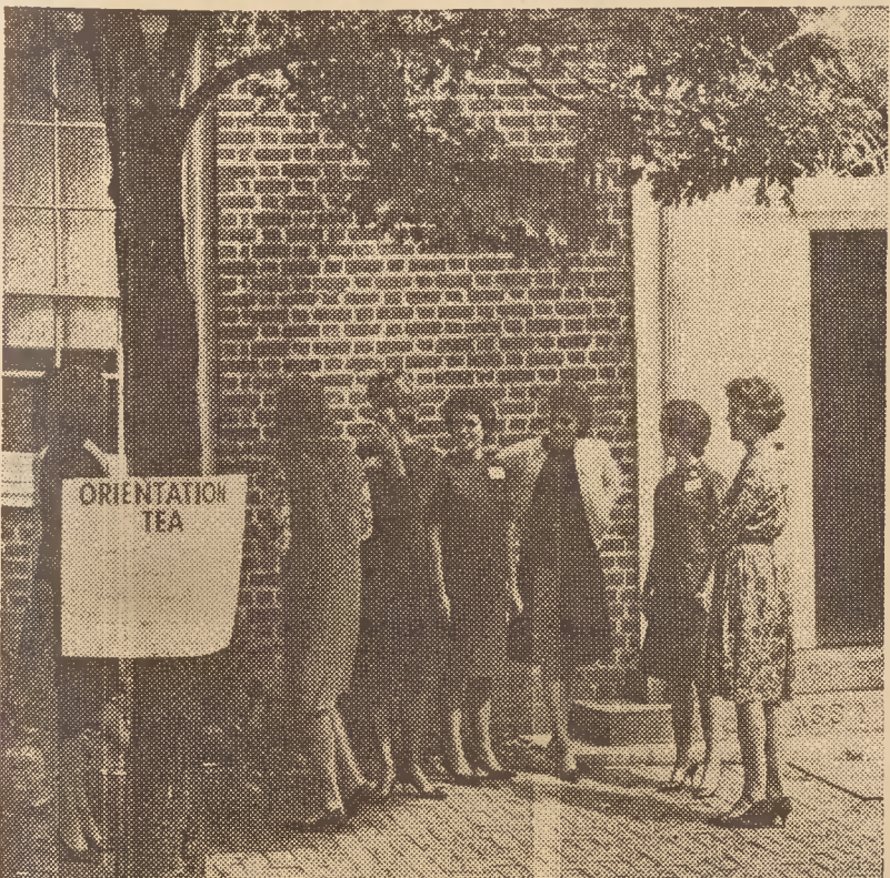
Welcome to Salem! Greeting the freshmen as they arrive on Sunday were members of the Orientation Committee.

Dean Hixson has announced that the total enrollment of Salem will probably reach 500 after all special students have completed registration. Earlier this week the enrollment totalled 495, with 95 seniors, 95 juniors, 114 sophomores, 144 freshmen, 45 special students, and 2 foreign students.