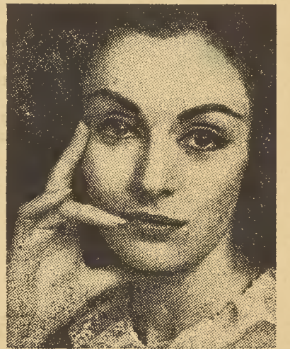
When does a woman need

As yet, the Salem collection is small, due to the fact that the Art Department is limited by the amount of the funds available for such purchases. The members of the department make the choices for the collection. Often Salem invites an artist to exhibit his works here and promises to buy one of the works upon the termination of the exhibit. In that manner, we are able to increase the collection, as well as provide excellent exhibits for the Salem students.