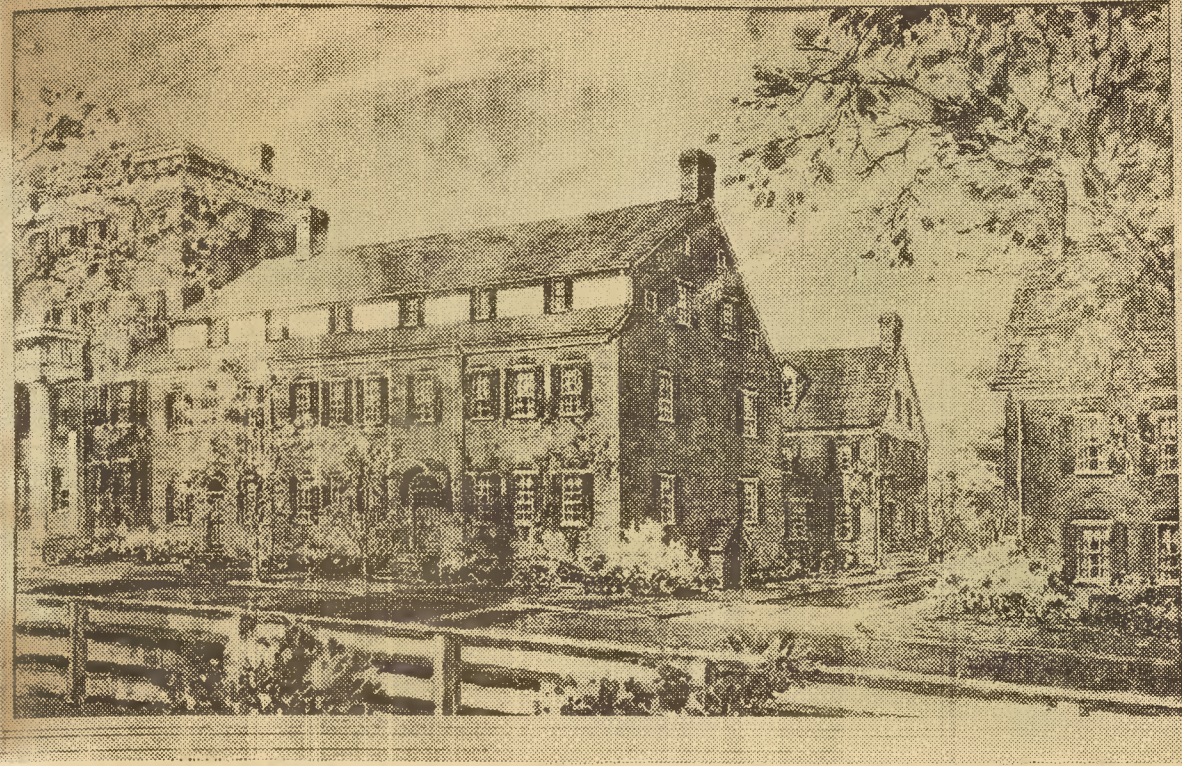
As the archway and fourth floor disappear, old South becomes new but familiar.