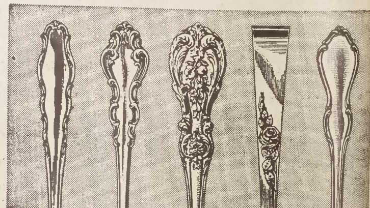
English Provincial Spanish Baroque Francis I Classic Rose Hampton Court

We have your favorite sterling pattern... as featured in Reed & Barton's