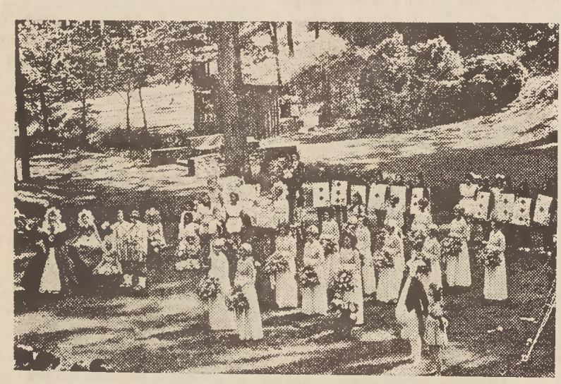
Alice and her Wonderland friends join the May Court for the crowning moment of May Day.