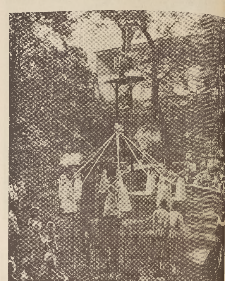
The fairest flowers of Salem re-enact a pagan ritual as the dance around the traditional May Pole.