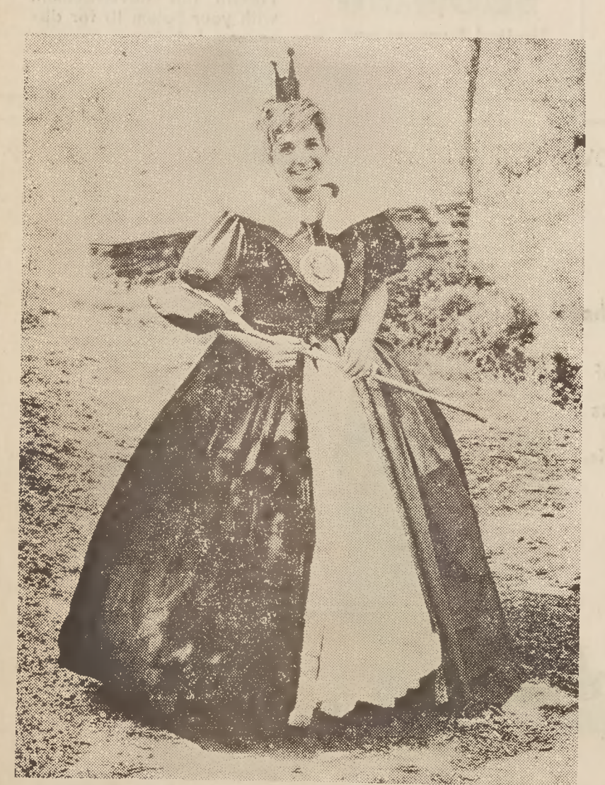
The Red Queen takes a break from headhunting to flash a rare