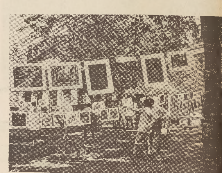
Forsyth County school students filled the Square with their of work last Saturday during their annual Clothesline Art Show.