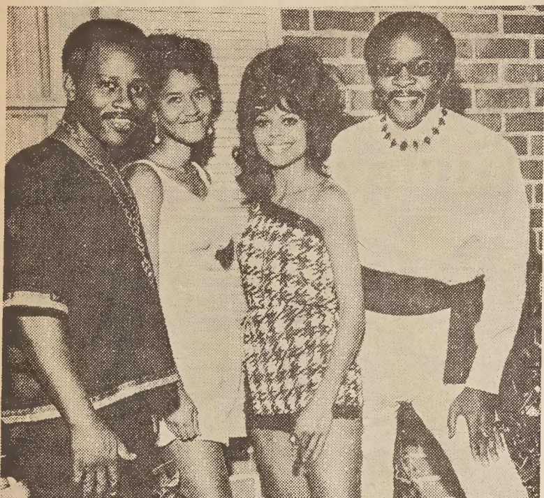
Friends of Distinction to perform Saturday night.