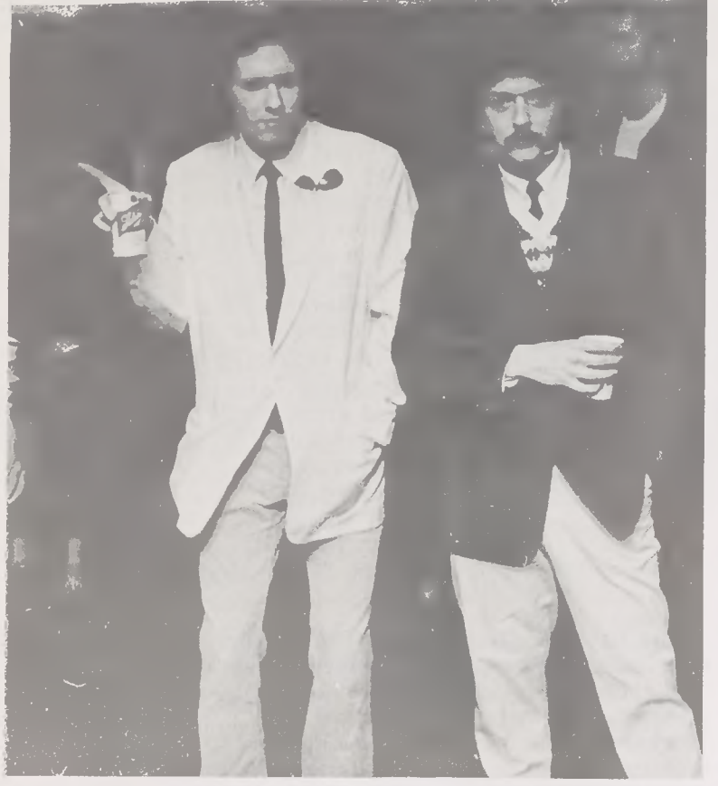
These two studs have it made in the shade.

Swingin' Salem Chicks and Greasy Dates Rock 'n Roll Fifties Style - Real Boss!