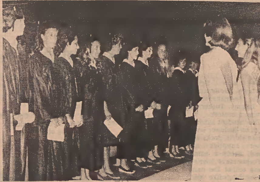
Espadrilles and elegance present at Convocation