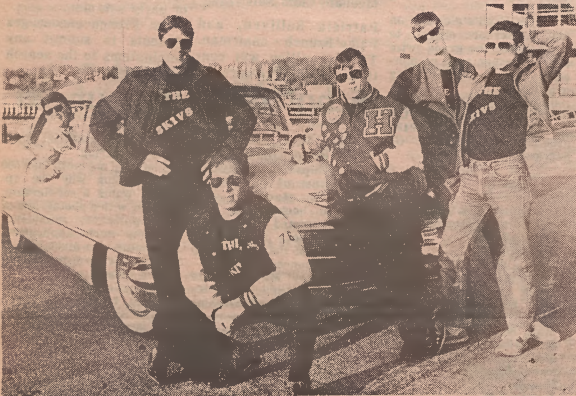
A '56 Cadillac provides the perfect background for the "Skivs," a fifties-style group of the United States Naval Academy Glee Club. With two other specialty groups - a barbershop quartet and folk trio - the Glee Club has a repertoire designed to appeal to all age levels and a variety of musical tastes. The club will perform in Hanes Auditorium on March 6 at 8:15 p.m.