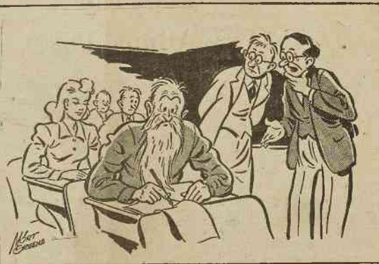
"He's been from kindergarten through college twice, but refuses to graduate 'til his Reynolds Rocket pen needs refilling!"

Entered as second-class matter October 26, 1931, at the postoffice at Goldsboro, N. C., under the act of March 3, 1879.