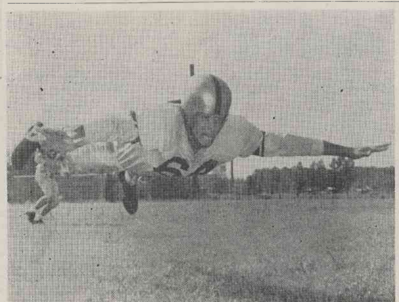
HIGH FLYING BLACKBIRD — Big Donald Stallings, 220 pound Blackbird tackle, toughens up for Wilmington encounter.