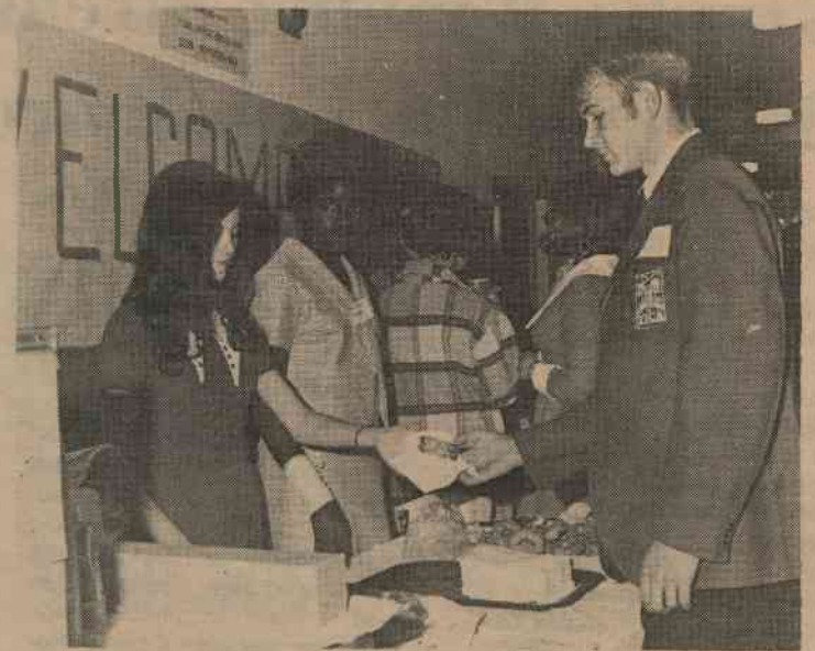
VICA DELEGATES GET REFRESHMENTS

Various sources indicate that the general intelligence of an individual develops as much from conception to age 4 as it does during the 14 years from 4 to 18.