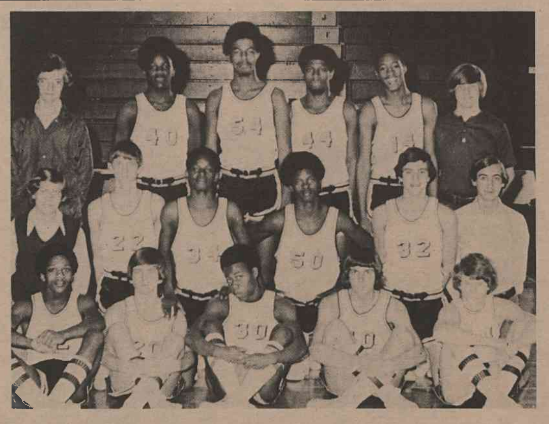
The 1973-74 Jayvee Basketball Team