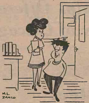
"Be careful! You may be encouraging me to drop out."