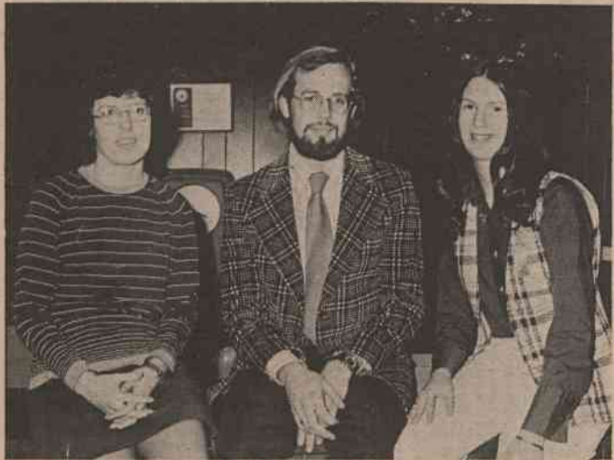
Seated above are three RMSH student teachers.