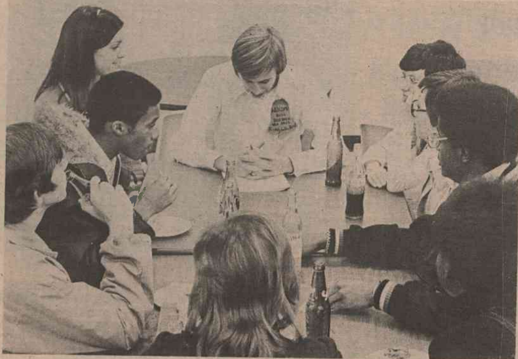
Pictured above is a random shot of Hey-Day, held February 5, after school.