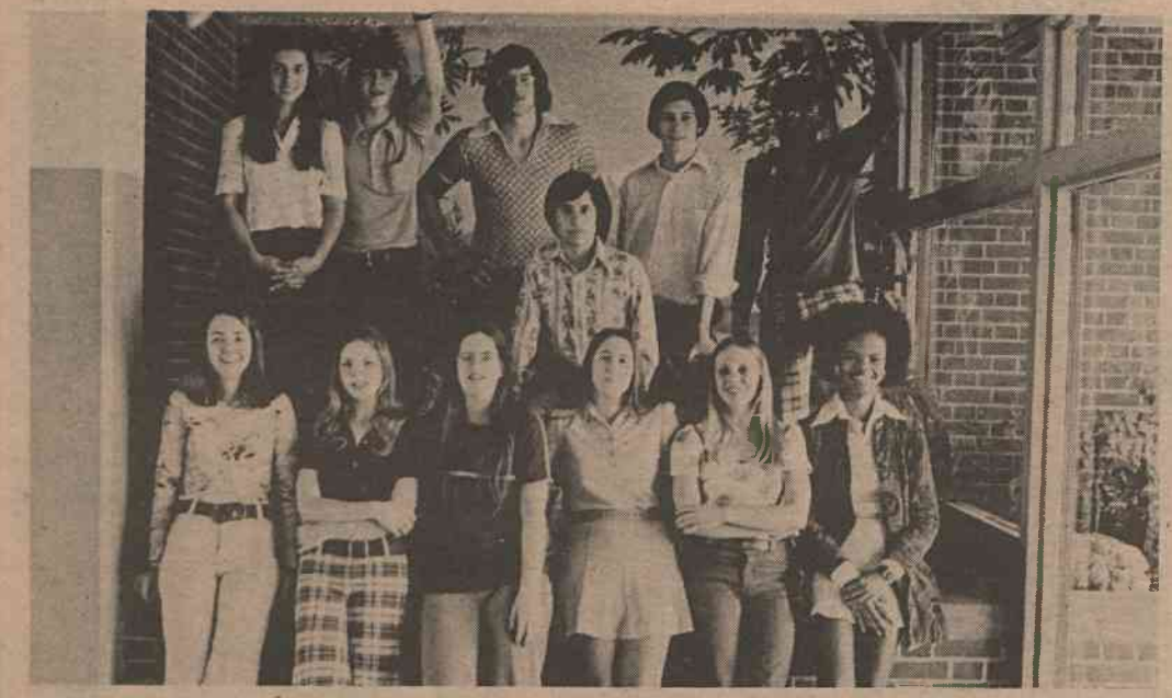
Above are the students who attended the District Drama Festival.