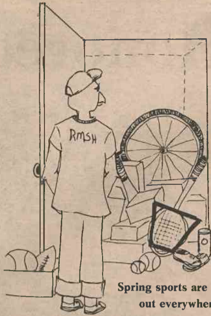
Spring sports are coming out everywhere!