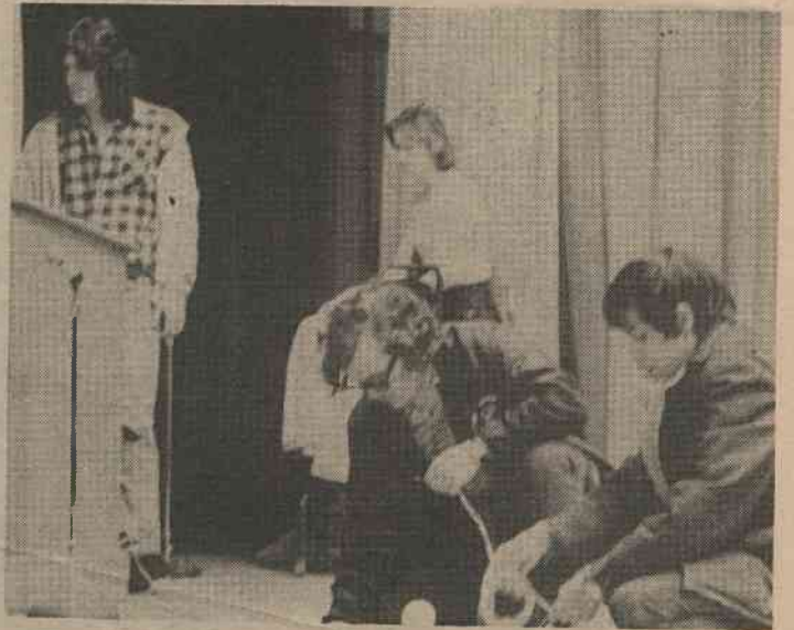
EVERYONE PLAYS A PART — Stage hands work diligently before the bicentennial production.