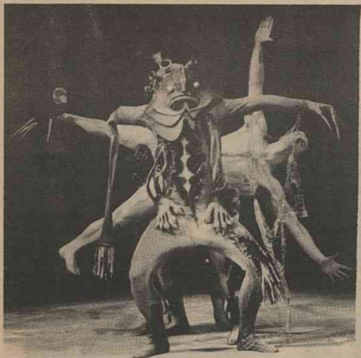
MIME THEATER PERFORMS: Foreign mime actors dramatize a play at the Tank Theatre.