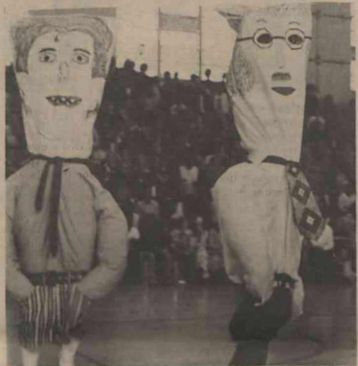
STUDENTS display costumes for hick day, 50's day, Halloween day, and the mini-parade in a show of school spirit for the homecoming game.

The dress up days, the mini-parade, and the election of Homecoming Queens all helped to make the days of October 25-29 "the most exciting week of the school year," as one vampire observed.