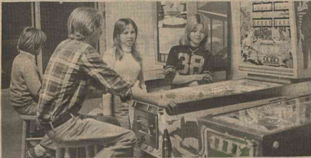
PINBALL MADNESS — teenagers check out the pinball machines at the newly opened Yellow Brick Road.