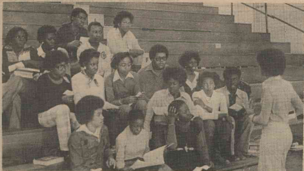
Black Heritage Committee practices...Students in the Black Heritage Committee prepared for the upcoming assembly.