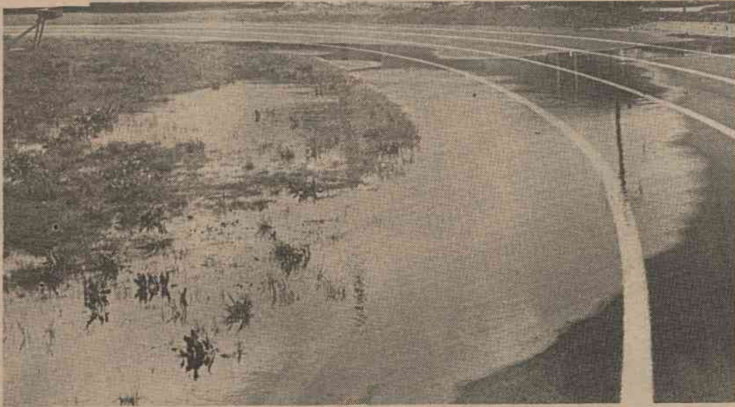
WATER STANDS ON TRACK The drainage of the track presents a difficulty for track participants as well as community members.