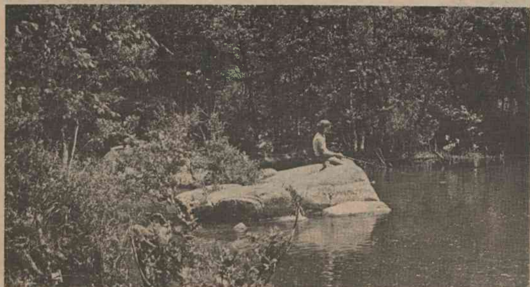
RESERVOIR MOVES... Both skiing and fishing are action sports, whether in the mind or the body. The Rocky Mount Reservoir offers great opportunities for those who ski, swim, picnic, fish and play. The Reservoir is large enough to "get away" in a small fishing cove or ski in the wide open space.

VACATIONERS SWIM ... This swimmer is enjoying the cool, relaxing, soothing water that the pool offers. The magnetism of water in summer brings people from every walk of life together.