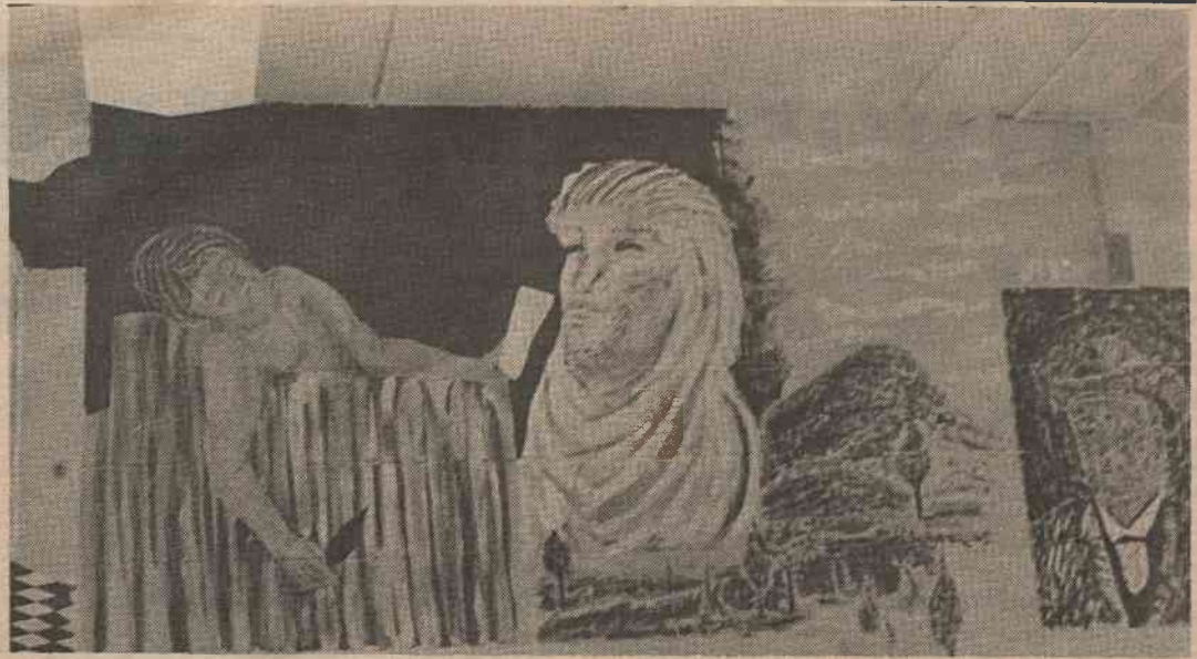
MURAL UNVEILED — The Historical Mural located in room 501, has been unveiled for the students and faculty of Senior High.