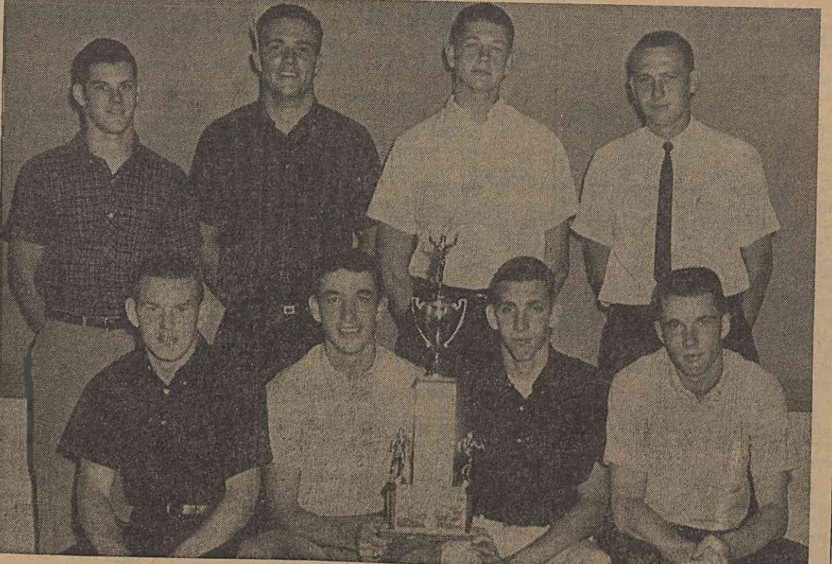
Albemarle Track Team Wins South Piedmont Conference Meet

by Albemarle, Statesville still won the meet. Albemarle placed sec-ond; Concord, third; Kannapolis, fourth; then came North Rowan, West Rowan, South Rowan, Chil-dren's Home, Asheboro, and East Rowan