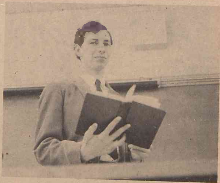
"... And they lived happily ever after!"