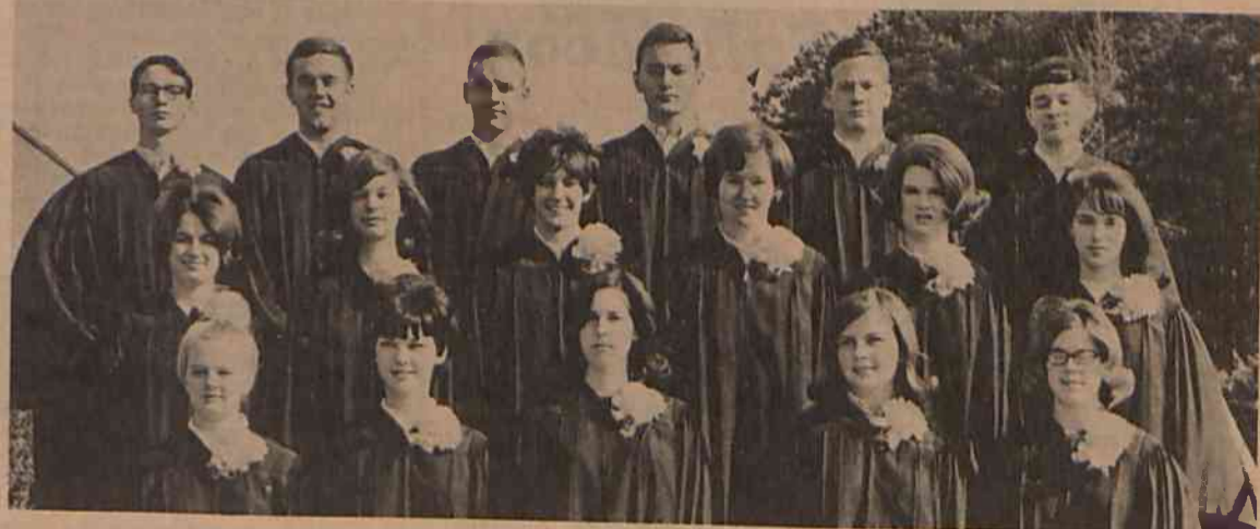
NEW MEMBERS OF ASHS CHAPTER OF NATIONAL HONOR SOCIETY

What is your reaction to the possibility of these changes? Inform The Full Moon of your opinion.