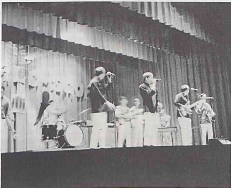
Juniors stage Spec-Talo-Scope as a chief money raising project.

A banquet and dance Monday night served as entertainment.