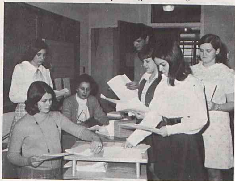
Fifth period trojans prepare materials for Mini-Courses.