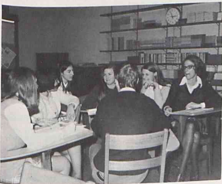
Former ASHS students discuss college life with Seniors.

They represented schools such as UNC-G, Wake Forest, Carolina, Coker, Western Carolina, Meredith, UNC-C. and Duke.