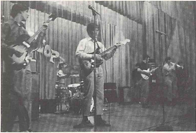
The Dekades drum up music for Spec-Talo-Scope IV.