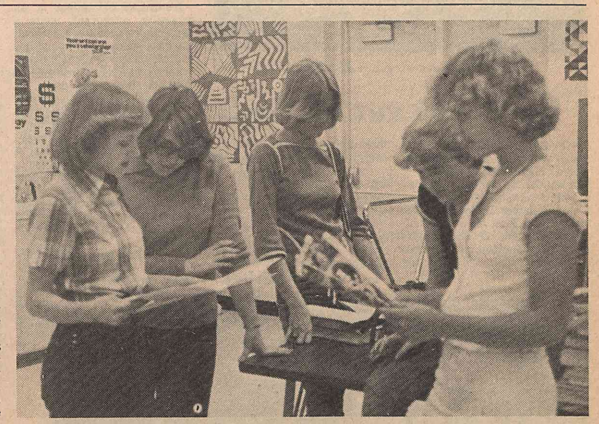
The members of the Decorations Committee are busy working on last-minute Prom details.

Invitations to the Prom were given out April 12 and students were asked to sign up in the library if they planned to attend. For those bringing an out-of-school guest, a $3 admis-sion fee will be charged. Couples attending the Prom may have their pictures taken by a professional photographer, and may purchase a package con-