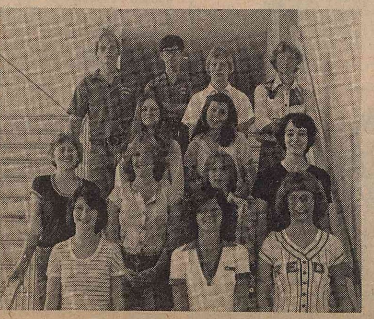
These students will attend the SPEC Program June 18-30.

Senior Council members are now busy deciding on a speaker for the evening and choosing marshals to assist in the graduation exercises. Class Valedictorian, salutatorian, Senior Class President and Student Council President will have speaking roles in the ceremony. A senior will sing the class song and an underclassman will play the organ for prelude and postlude music.