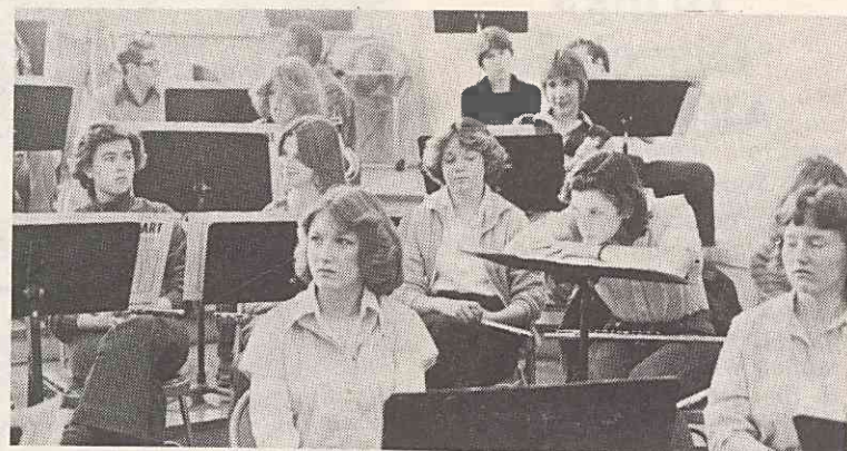
Band students anticipate their trip to Washington, D.C.