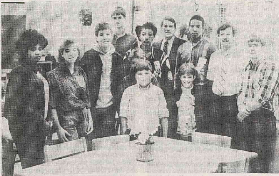
The Student Advisory Committee

This new method of communication will give students a louder voice in routine school policies and activities. If any student has an idea, he is asked to see any of our four representatives. The representatives will receive all ideas openly and will present them to the superintendent.