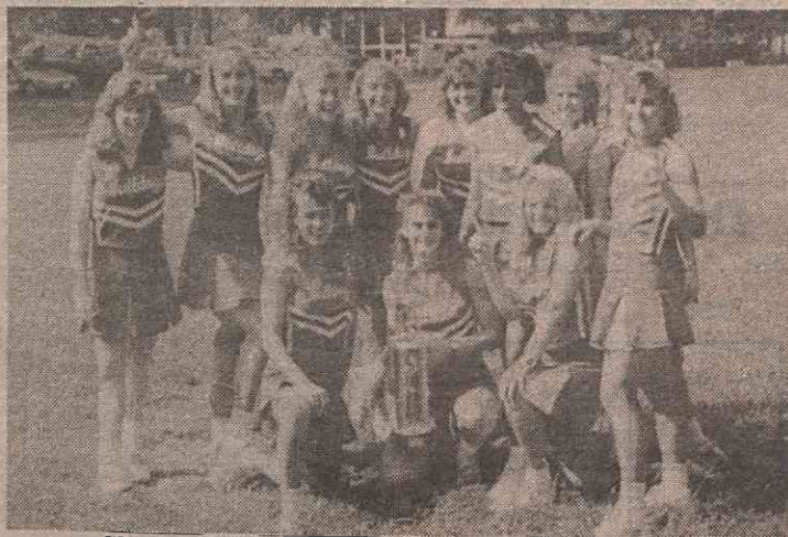
Cheerleaders Show Off Their State-Winning Smiles.

As you can see, the cheerleaders have been very busy lately. They should be congratulated on their past achievements as well as for promoting school spirit and cheering for our athletic teams. They do a great job which is often overlooked, but by going to the nationals, they are receiving some well-deserved recognition.