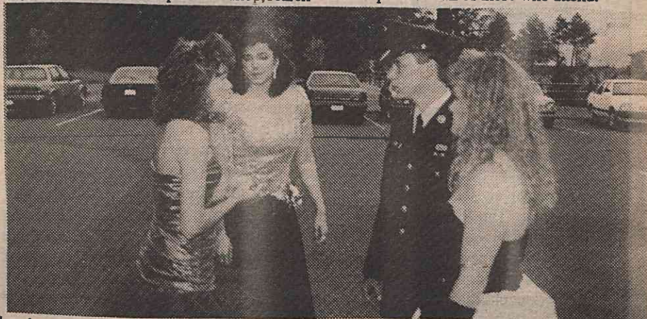
Last year's prom-goers wait in the restaurant parking lot as their magical evening of dining and dancing begins.

Once final plans and preparations are made, nothing is left but numerous conversations about every detail with anyone who will listen. Although this time is very chaotic and students minds seem to wander during school, this glorious night offers a sense of magic and unbearable anticipation to all of those who attend.