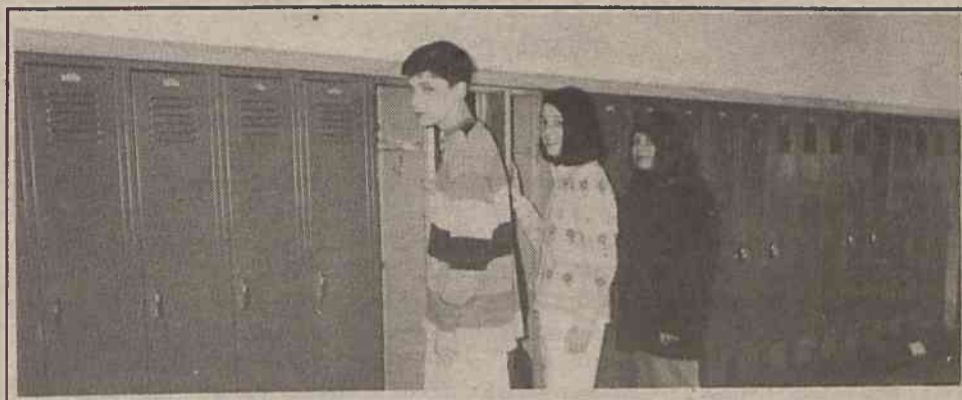
These students are thankful they made it to AHS in time, but they don't look forward to another year of being the youngest class - again.

The School Board was not anxious to make this change, but it was the only way to keep certain faculty paychecks up to par. Rising sophomores, you will still be the youngest students at AHS, so look forward to another year of junior and senior domination.