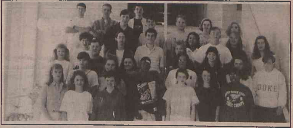
These senior scholars will be honored at the Academic Awards Banquet.

There will be a catered dinner for parents and students who will be served by the top juniors. Honored students will receive an engraved plaque and several gifts during the evening.