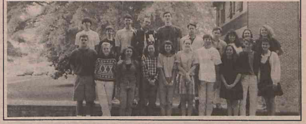
The junior class is very strong academically with 23 members inducted into National Honor Society. Seniors to be honored at Academic Awards Banquet