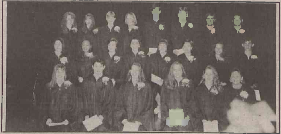
The 1993 inductees of the National Honor Society.

Congratulations to each of these students for their outstanding achievements.