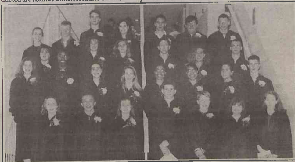
NHS members pose after their induction on March 28.