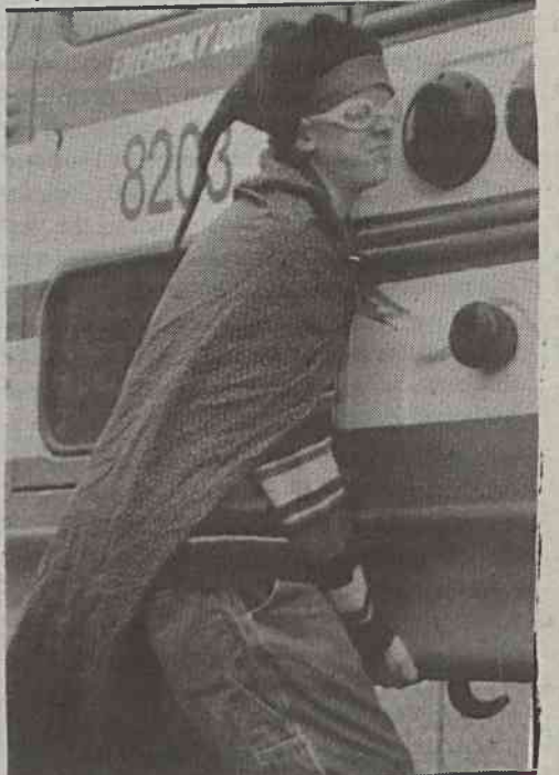
SDOJM shows his courage by protecting the innocent.