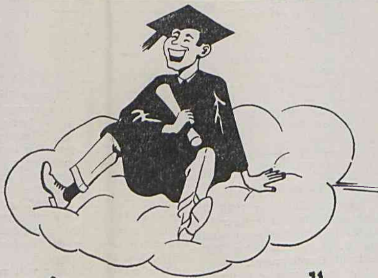
"Safe on Third"