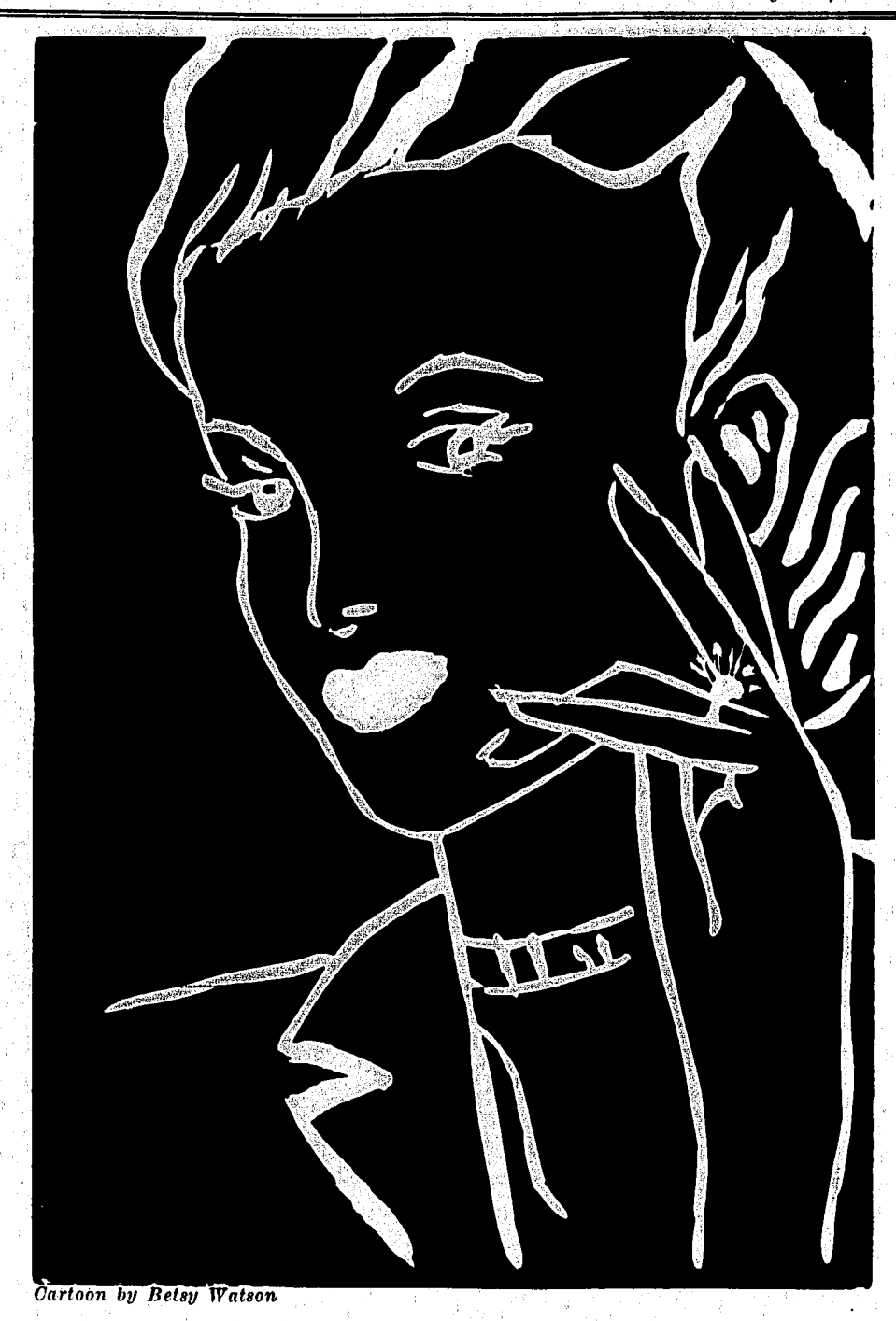
It's the Latest Style