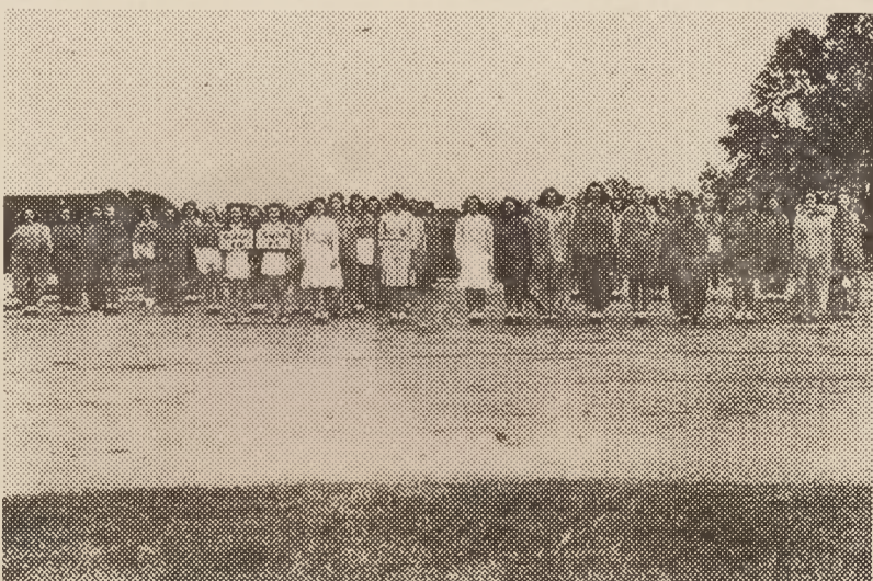
The picture above was taken at the 1944 celebration of Meredith Palio. The Senior Class, with the Campbell Soup theme, won the Palio Banner.