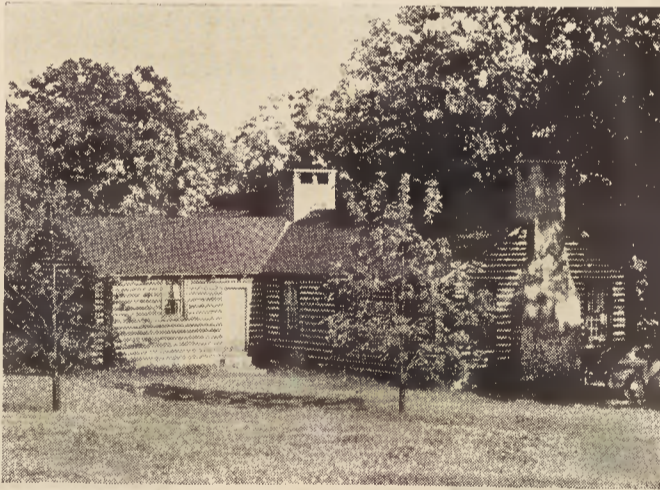
For their gift-project, the Class of '47 leaves the Hut newly outfitted with shelves, lamps, coat racks, cabinets, drapes, and other colorful decorations.