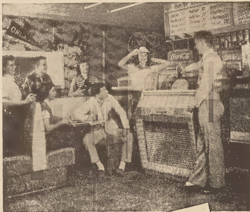
Brooks Student Store Oklahoma A & M College Stillwater, Oklahoma

Little Theatre has great plans for this year, and we hope that all of you who find a thrill in the theater will come to our meetings and help us. Little Theatre will be only as good as its members. We have loads of fun. Please pay us a visit and see for yourself.