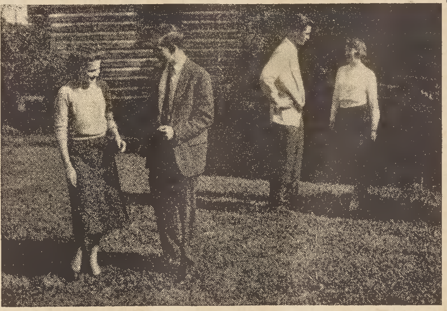
which Meredith was then called, Students bring their dates to the Hut, which is being renovated as a Student Union.

Plans are now being made to begin classes in the new arts building on Monday, October 29. Books and records are being moved now.