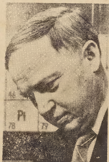
Dr. Harlow Shapley