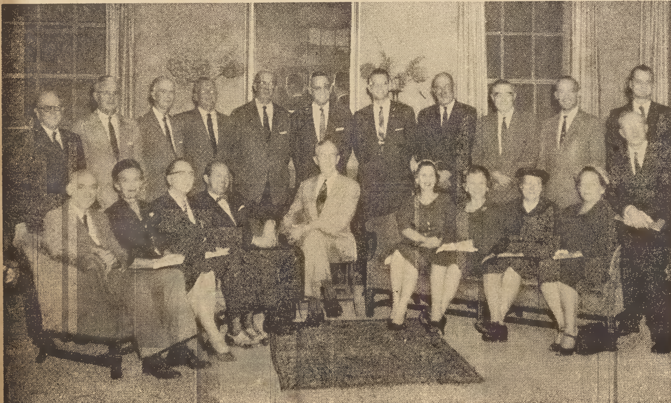
Meredith College Board of Trustees