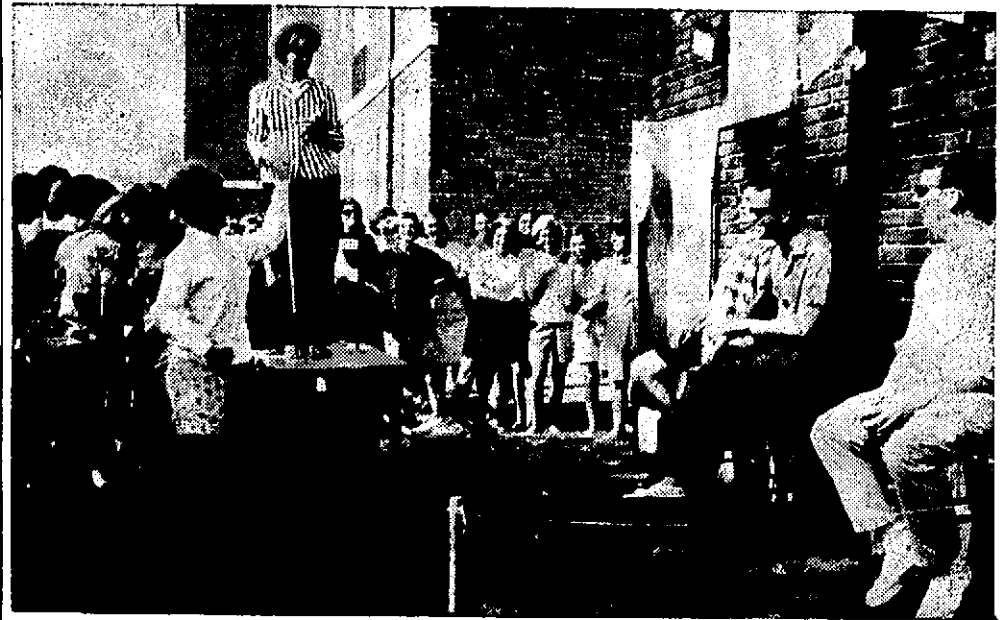
An especially popular booth at the Play Day carnival gave students a chance to throw water balloons at faculty members.